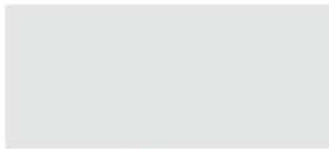
Linen White (81) 1,2

26 Gauge, Kynar 500®/Hylar 5000 Paint Finish