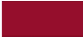
Patriot Red (73) 1