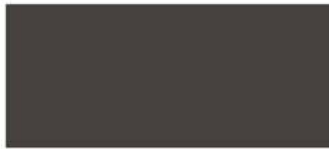
Burnished Slate (49)