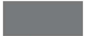
Zinc Grey (29) 3