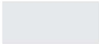
White (30) 1