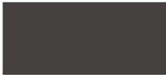
Burnished Slate (49) 3