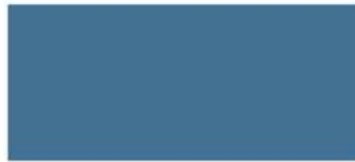
Hawaiian Blue (70)